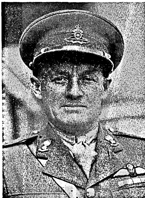
MAJOR CONN SMYTHE, M.C.

in sympathy, and to the Major's family, and I am sure all will join me in the hope that his recovery will be speedy and complete.